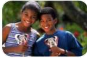
Children of Inmates